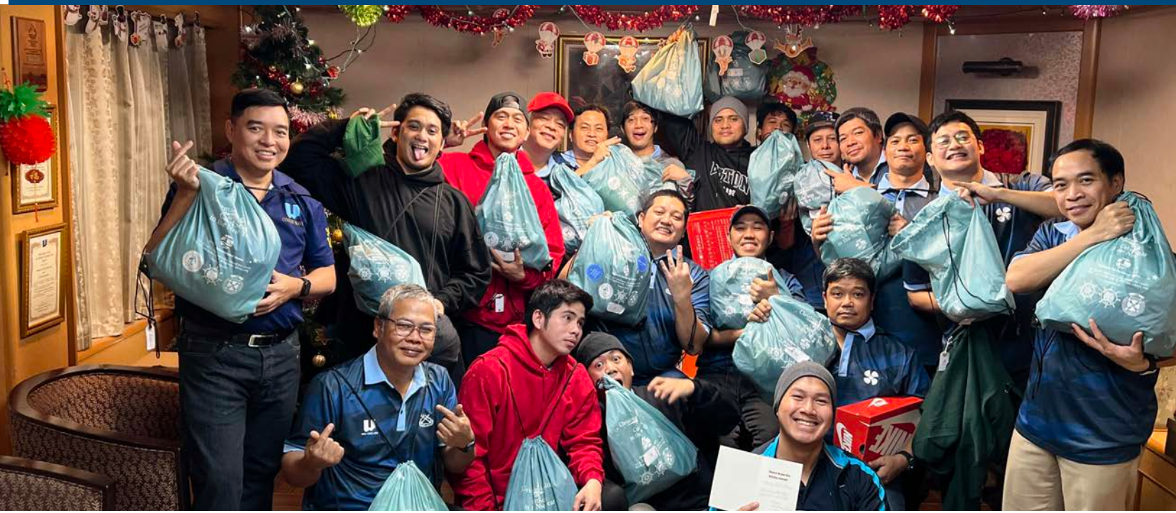
Email message to SIH's supporters: "We from the M/V NSU OBELISK would like to thank you for your kindness and for having given us these gifts made with Love. Attached is a photo that shows how much happiness you had given us." Christmas 2024.